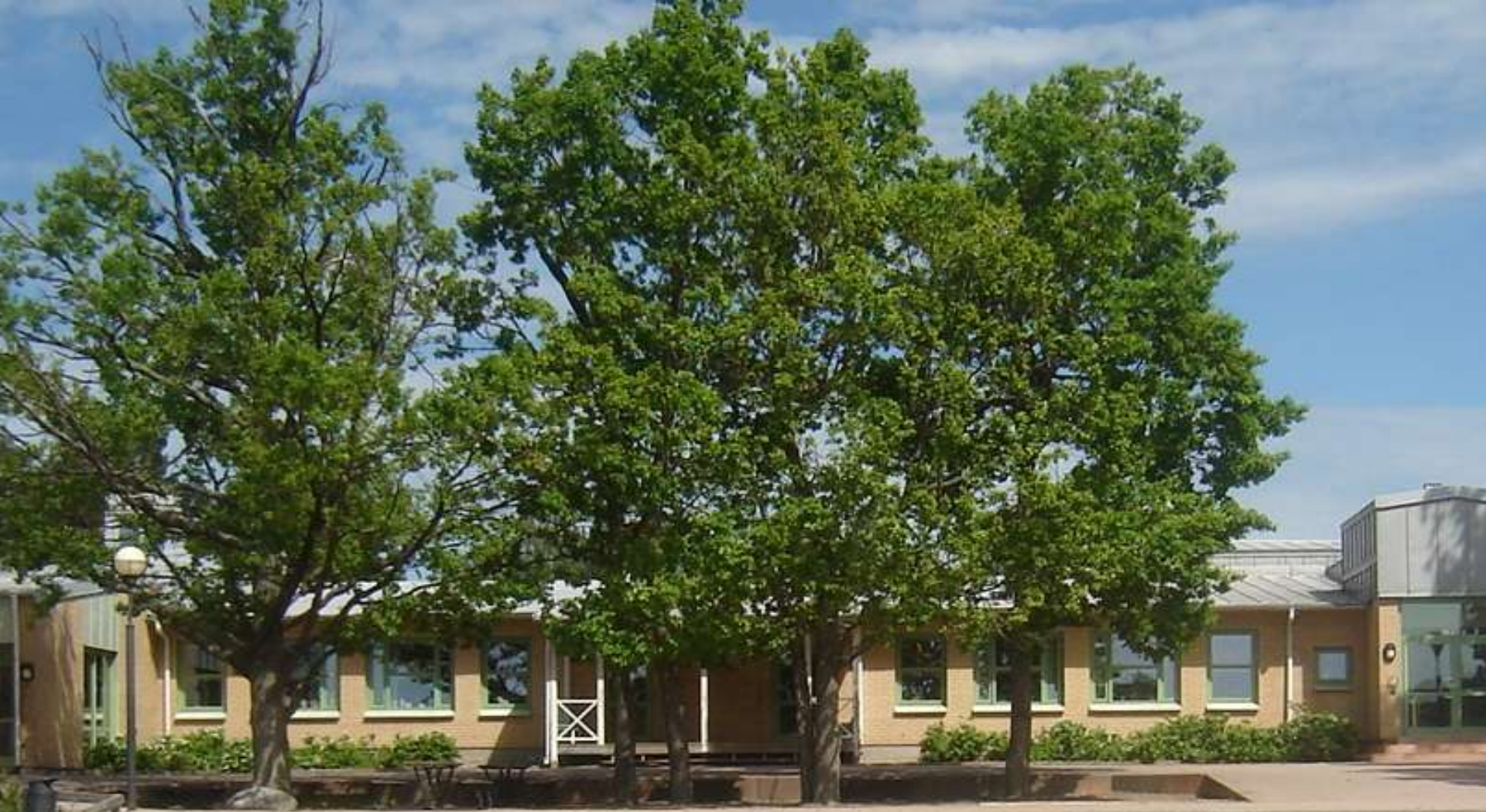
Ekbergaskolan Västerås Sweden